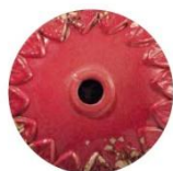
VIR VINTAGE ROSSO