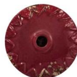
VIX VINTAGE BORDEAUX