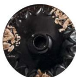
VIN VINTAGE NERO