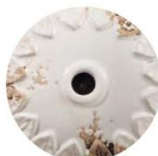
VIB VINTAGE BIANCO