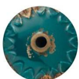
VIV VINTAGE VERDE