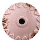
VIC VINTAGE CIPRIA