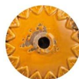
VIG VINTAGE GIALLO