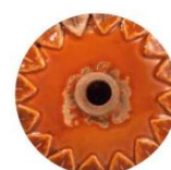
VIO VINTAGE ARANCIO