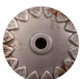
VIT VINTAGE TORTORA