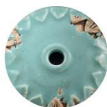
VIA VINTAGE AZZURRO