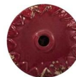
VIX VINTAGE BORDEAUX