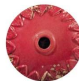
VIR VINTAGE ROSSO