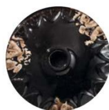
VIN VINTAGE NERO