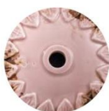
VIC VINTAGE CIPRIA