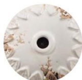
VIB VINTAGE BIANCO